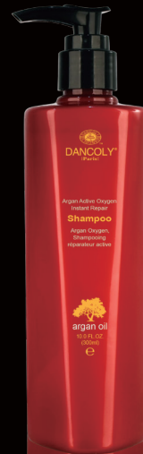
Argan Active Oxygen Instant Repair Shampoo

Argania Spinosa Kernel Oil Grape Seed Oil Opuntia Tuna (Cactus Plant) Extract Boswellia Carterii Oil