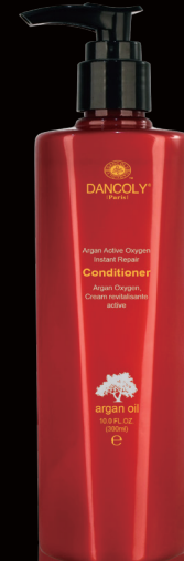
Argan Active Oxygen Instant Repair Conditioner